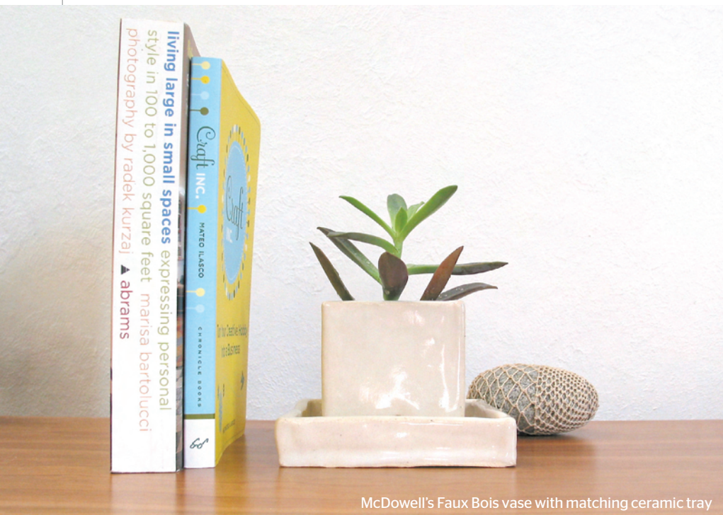
McDowell's Faux Bois vase with matching ceramic tray