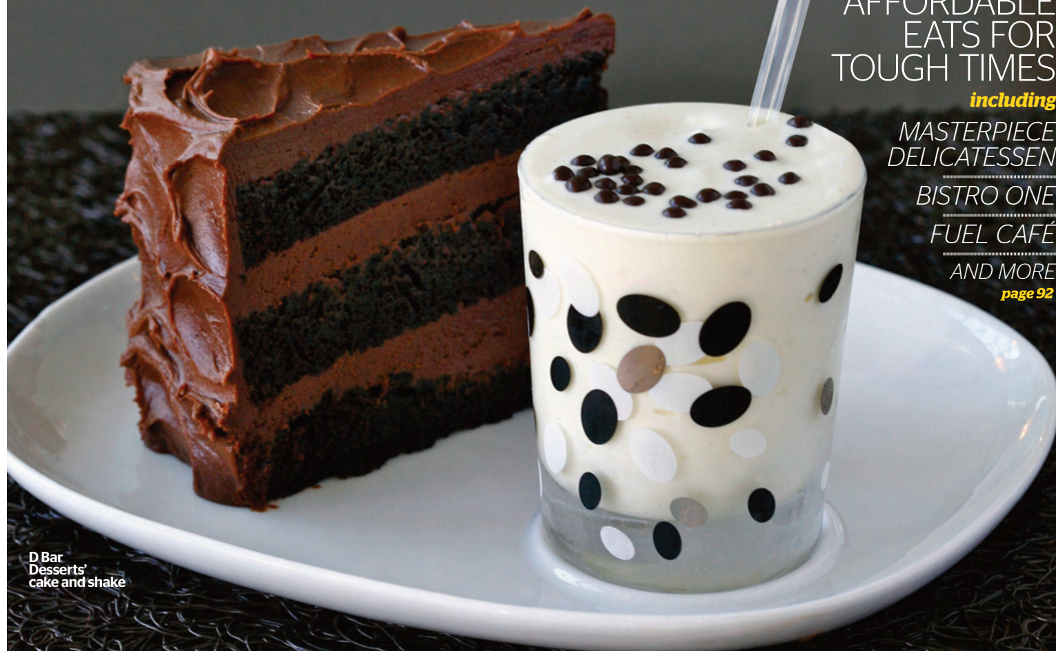
D Bar Desserts' cake and shake